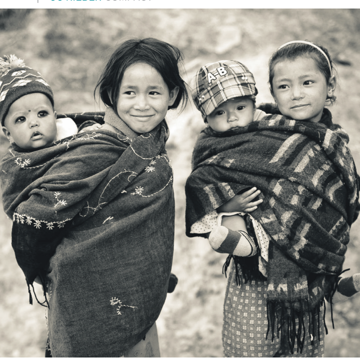
SAVING LIVES THROUGH GENERATIONS